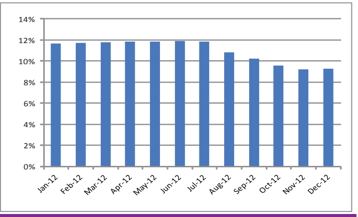
Credit Quality of the Portfolio as of December 31, 2012 (% of Total Assets)